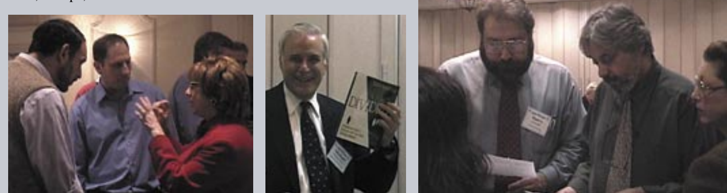
Scenes from CRC's 14th National Conference.

For conference updates and registration, visit www.crckids.org.